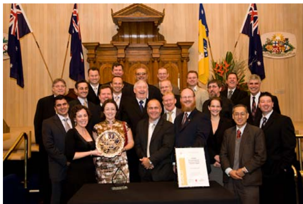
Energy Australia's 2009 Award Team

Students, leaders and organisations committed to optimal asset management were included as recipients of the prestigious annual Asset Management Awards.