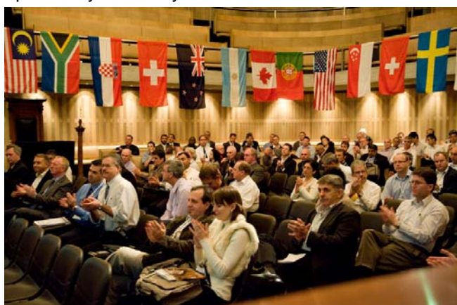
Attendees of the 2009 ICOMS conference

Other topics covered during the conference included the role asset management faces with the challenges of global warming, depletion of natural resources, increase in world population and increase in technical dependency of society.