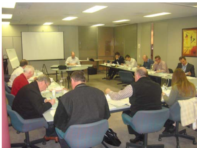
Recent Asset Management Fundamentals course participants, Melbourne

This one day course equips participants with an understanding of how their businesses can benefit from effective asset management capability.