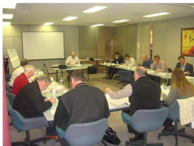
Recent Asset Management Fundamentals course participants, Melbourne

This one day course equips participants with an understanding of how their businesses can benefit from effective asset management capability.